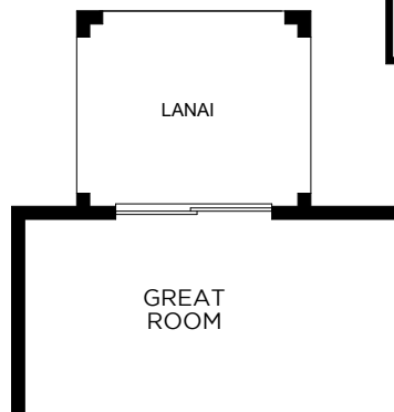
OPTIONAL COVERED LANAI

1107 Happy Forest Loop, DeLand, Florida 32720 • (407) 392-2606