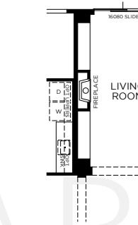
OPTIONAL FIREPLACE AT LIVING ROOM