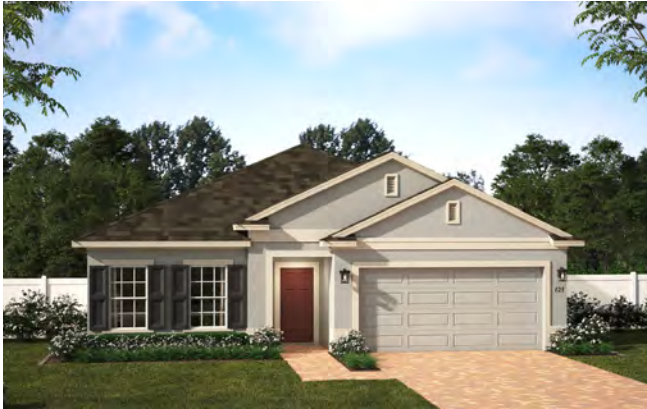
Elevation 2 – Stucco