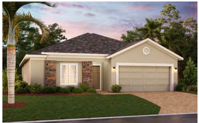
Elevation 3 – Stone

6097 Vision Rd., St. Cloud, FL 34771 • (407) 594-8587