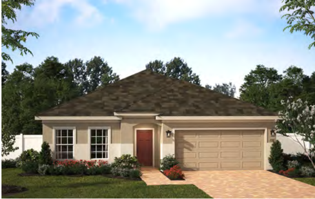
Elevation 1 – Stucco