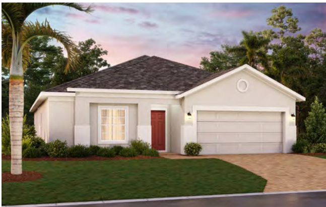
Elevation 3 – Stucco