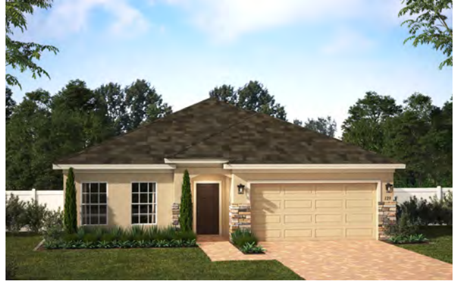
Elevation 1 – Stone