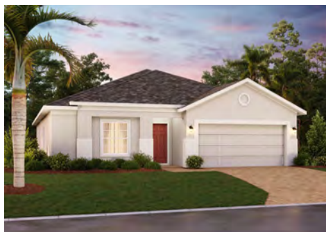
ELEVATION 3 - STUCCO

Renderings shown are examples. See sales office for range of finishes and configurations for the homes in this community.