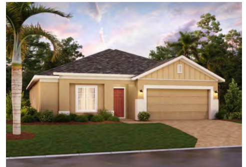
ELEVATION 3 - CLADDING