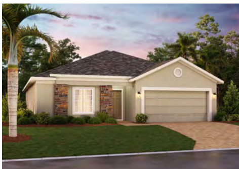
ELEVATION 3 - STONE