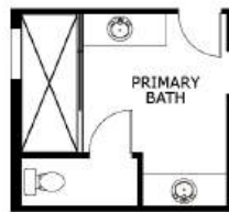
OPTIONAL DELUXE PRIMARY BATH 2