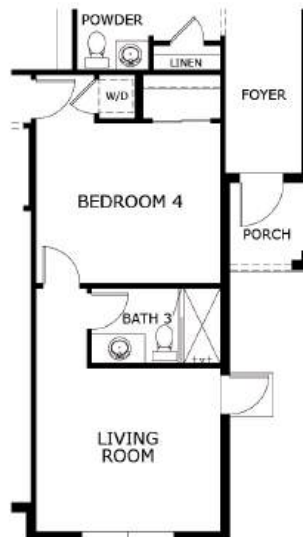
OPTIONAL MULTI-GEN SUITE

2027 Beevalley St, DeLand, FL 32720 • (386) 222-1243