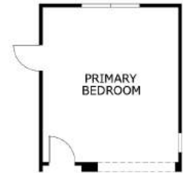
OPTIONAL EXTENDED LANAI AT SECOND FLOOR

2027 Beevalley St, DeLand, FL 32720 • (386) 222-1243