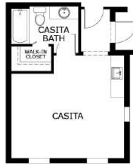
OPTIONAL CASITA AT TRADITIONAL AND TRANSITIONAL