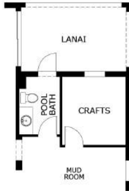
OPTIONAL POOL BATH