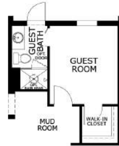
OPTIONAL GUEST BEDROOM AND BATH