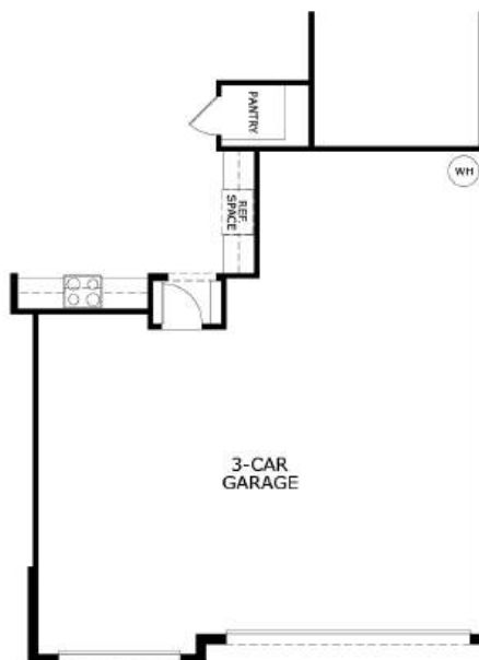
OPTIONAL 3 CAR GARAGE PLUS

2027 Beevalley St, DeLand, FL 32720 • (386) 222-1243