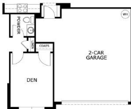
OPTIONAL DEN AND POWDER BATH