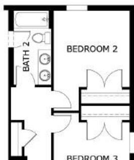
OPTIONAL ALTERNATE BATH 2