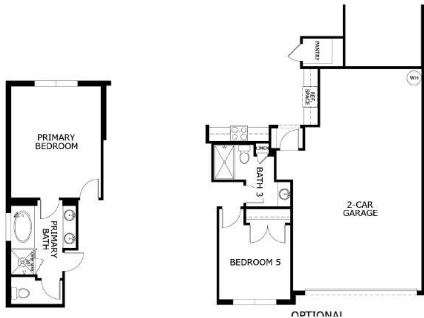
OPTIONAL PRIMARY BATH GARDEN TUB