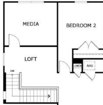
OPTIONAL MEDIA W/ 2ND FAMILY LOFT