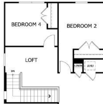
OPTIONAL BEDROOM 4

2027 Beevalley St, DeLand, FL 32720 • (386) 222-1243