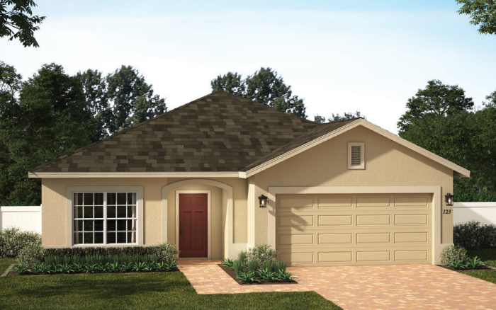
Elevation 2 Stucco