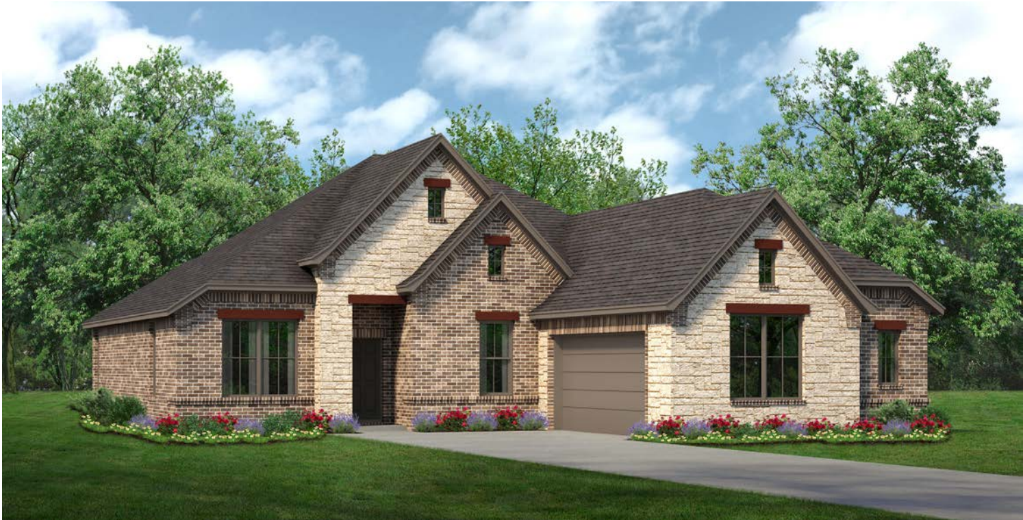
ELEVATION D – STONE

2,267 Square Feet • 3 Bedrooms • 2 Baths • 2-Car Garage