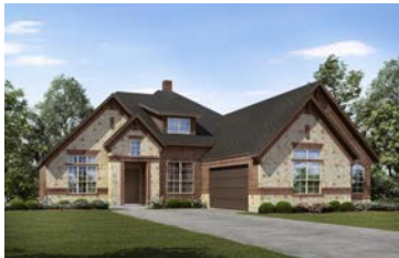
ELEVATION C – STONE

111 Aria Court, Forney, TX 75126 • (817) 736-1289