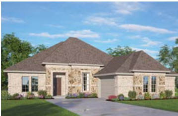
ELEVATION B – STONE