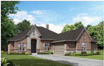
ELEVATION A – STONE