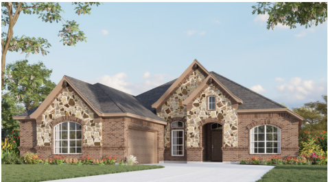
ELEVATION B - STONE

902 Meadow View Drive, Cleburne TX 76033 • (817) 704-4086