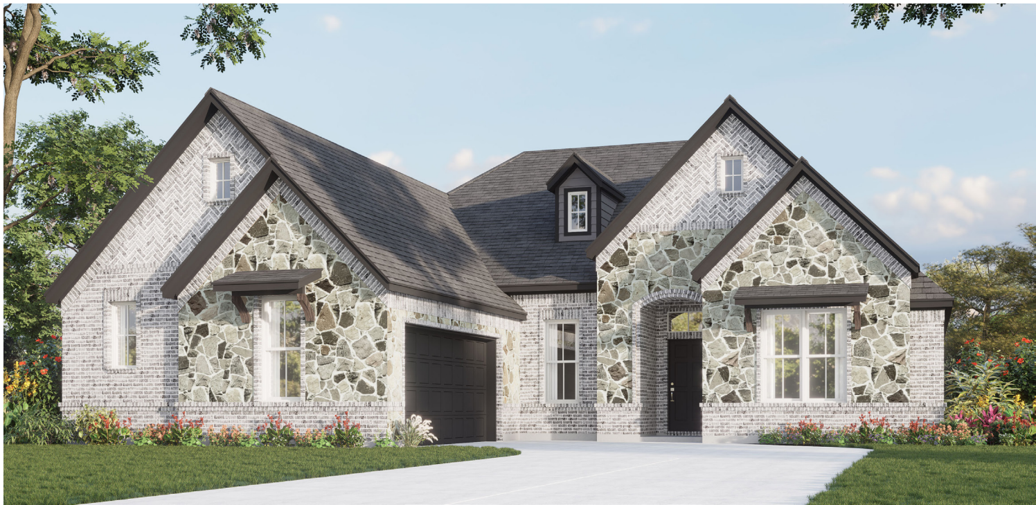
ELEVATION C - STONE

2,050 Square Feet • 3 Bedrooms • 2 Baths • 2-Car Garage