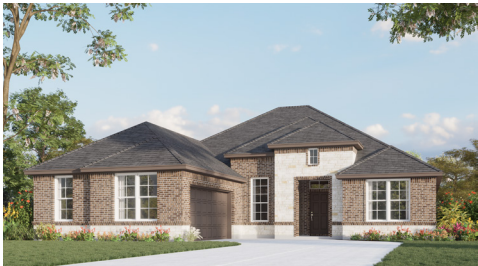
ELEVATION A - STONE