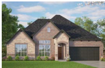
ELEVATION C – STONE

4413 Sweet Acres Avenue, Joshua, TX 76058 • (817) 670-5958