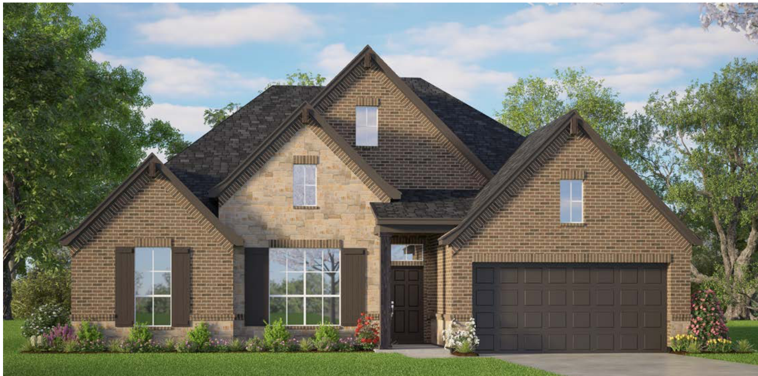
ELEVATION D – STONE

2,040 Square Feet • 3 Bedrooms • 2 Baths • 2-Car Garage