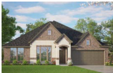
ELEVATION B – STONE