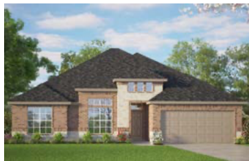
ELEVATION A – STONE