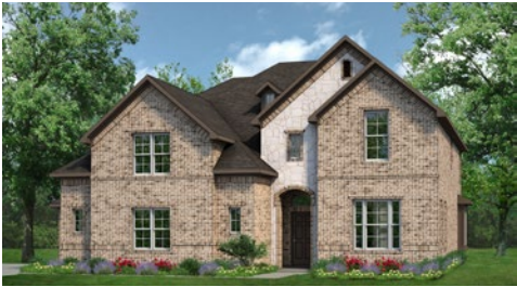
ELEVATION A - STONE