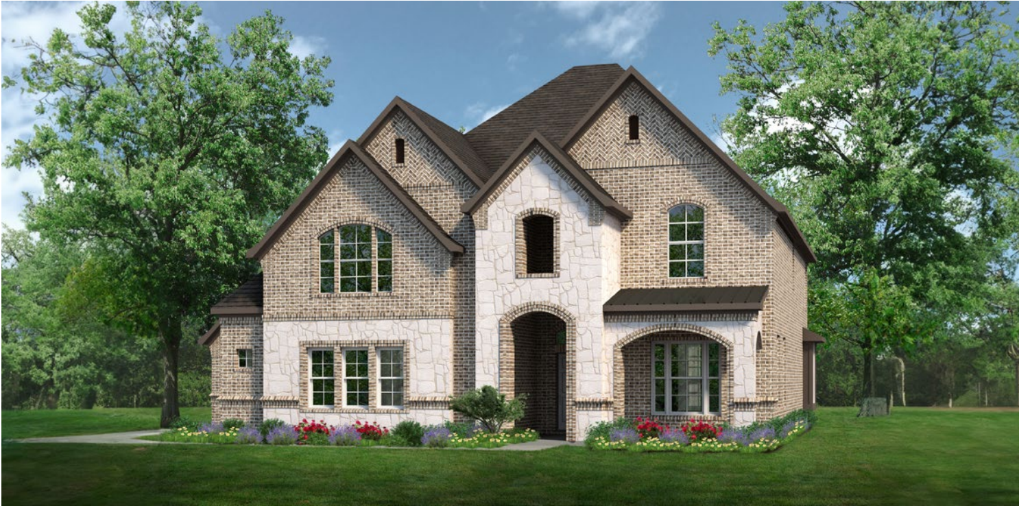
ELEVATION C - STONE

3,115 Square Feet • 4 Bedrooms • 2.5 Baths • 2-Car Garage