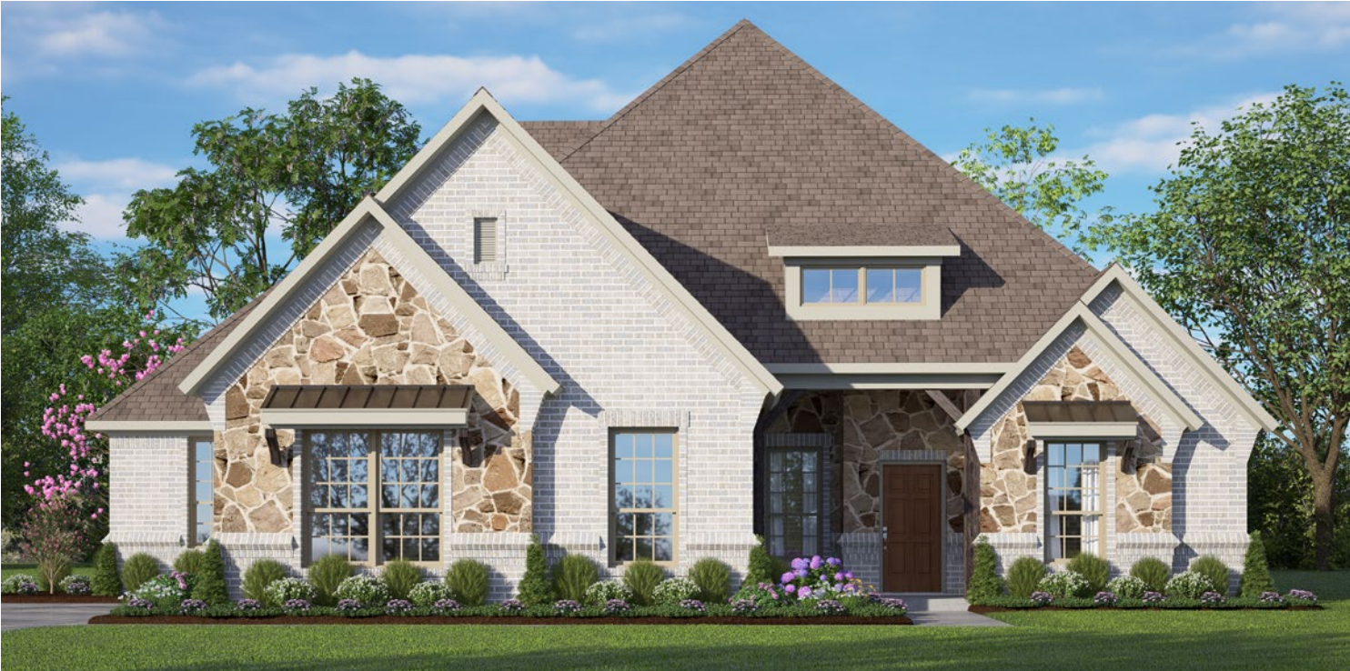
ELEVATION C - STONE

2,555 Square Feet • 3 Bedrooms • 2.5 Baths • 2-Car Garage