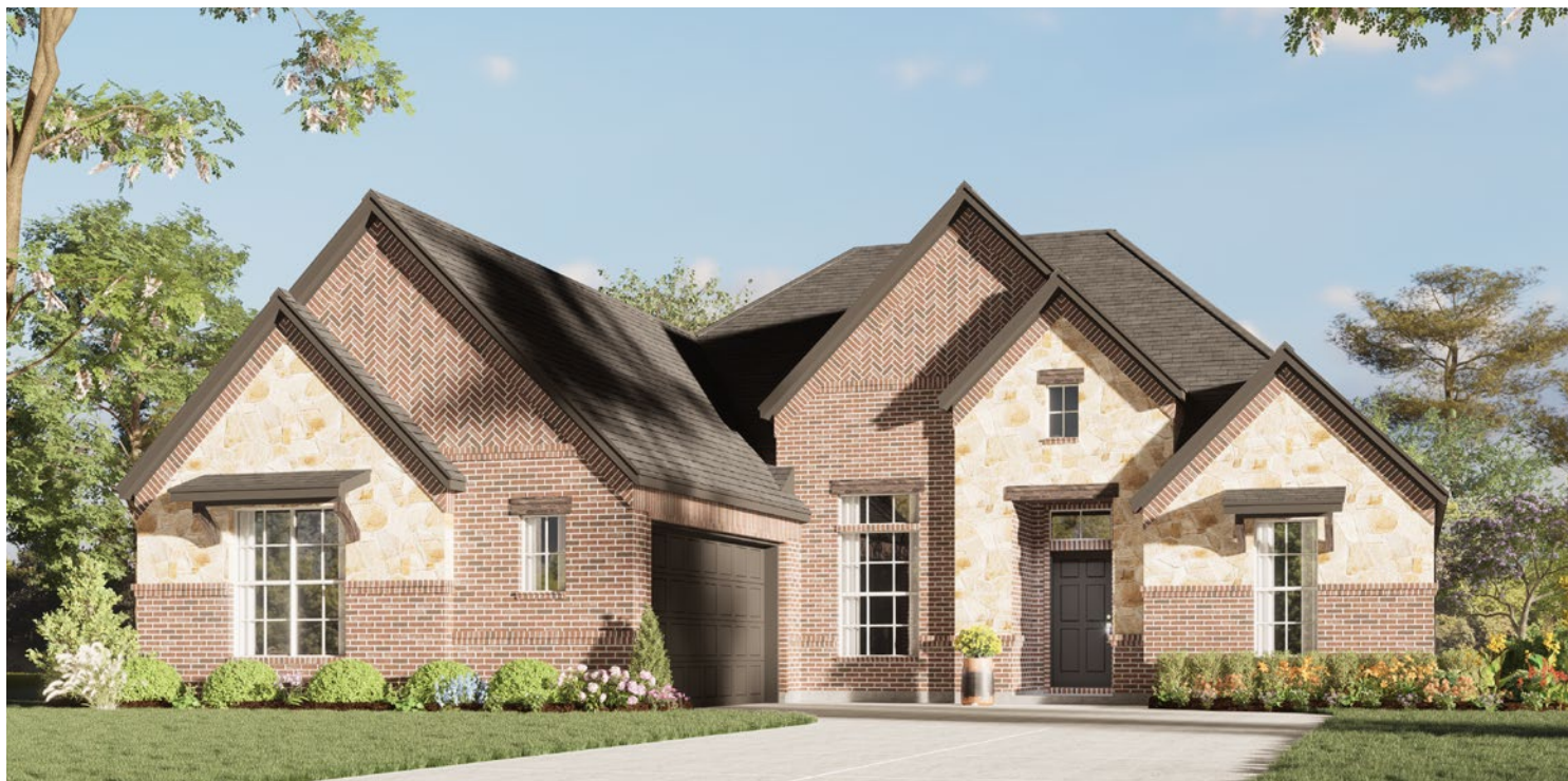
ELEVATION C - STONE

2,370 Square Feet • 4 Bedrooms • 2 Baths • 2-Car Garage