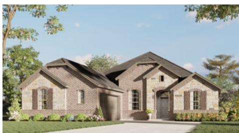
ELEVATION A - STONE