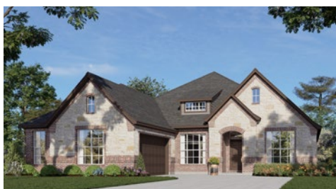
ELEVATION B - STONE

722 Winecup Way, Midlothian, TX 76065 • (817) 752-4525