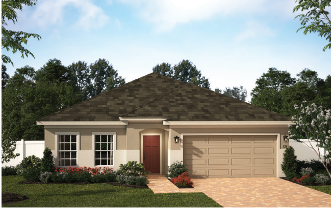
Elevation 1 – Stucco