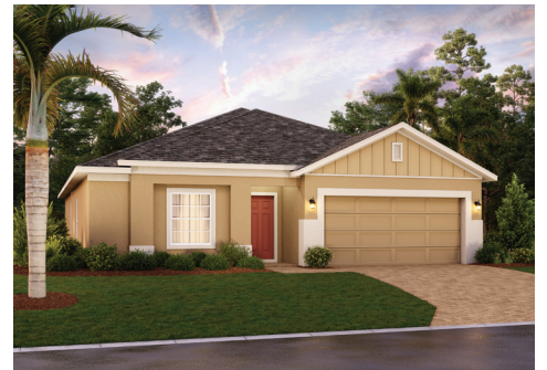
ELEVATION 3 - CLADDING