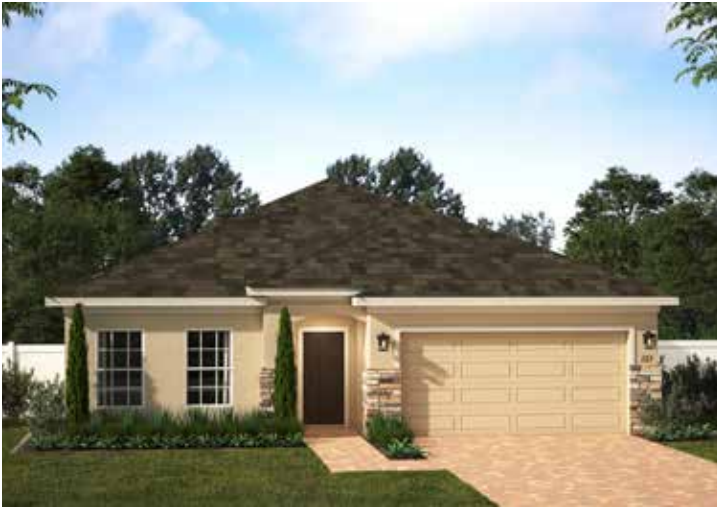
ELEVATION 1 - STONE