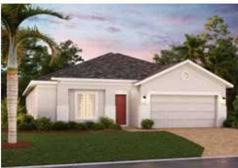
ELEVATION 3 - STUCCO