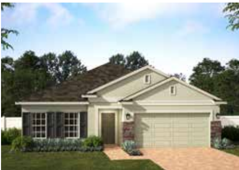
ELEVATION 2 - STONE