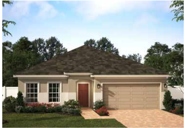
ELEVATION 1 - STUCCO