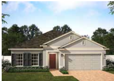
ELEVATION 2 - STUCCO