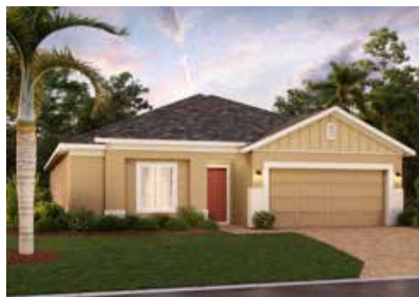
ELEVATION 3 - HARDIE

Renderings shown are examples - see sales office for range of finishes and configurations for the homes in this community.