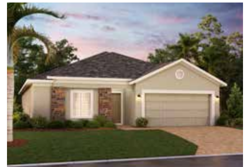
ELEVATION 3 - STONE