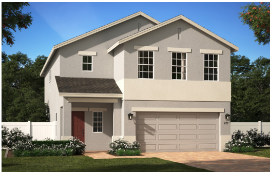
Elevation 2 - Stucco