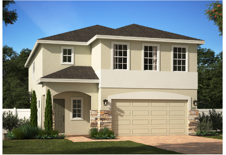
Elevation 1 - Stucco