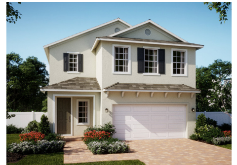
Elevation 3 - Stucco