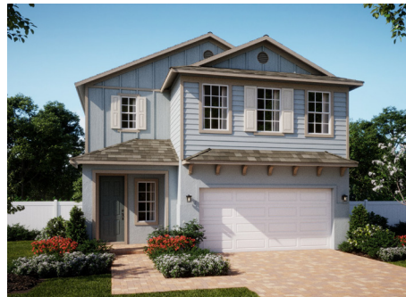
Elevation 3 - Hardie

7504 Catania Loop, Clermont, FL 34714 • (407) 972-0445