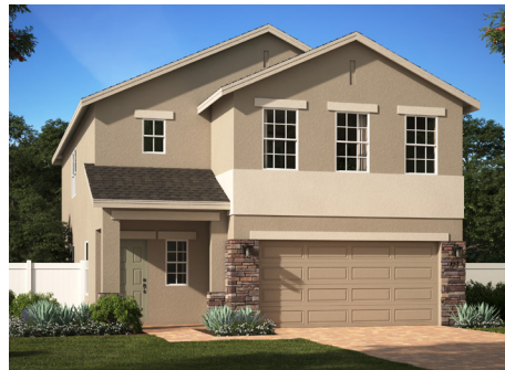
Elevation 2 - Stone