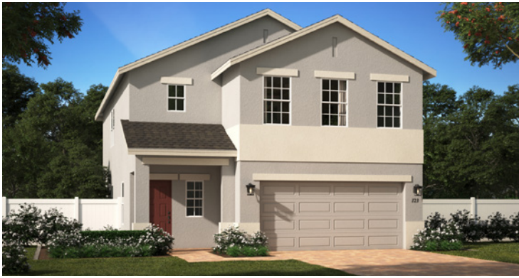
ELEVATION 2 - STUCCO