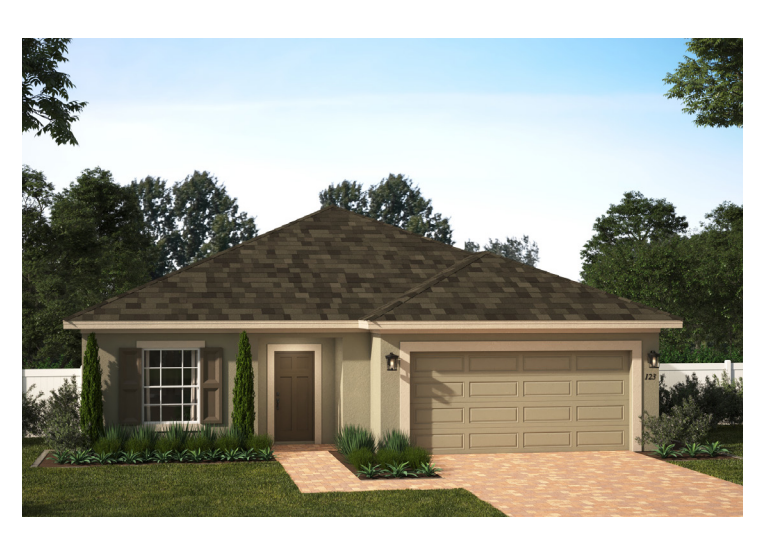
Elevation 1 - Stucco