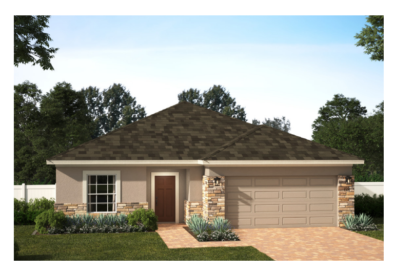
Elevation 1 - Stone

2,105 Square Feet • 4 Bedrooms • 3 Baths • 2-Car Garage