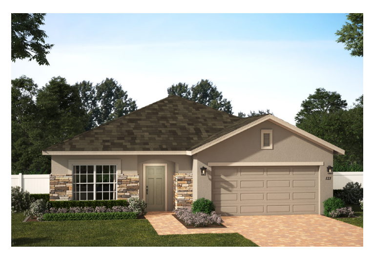
Elevation 2 - Stone