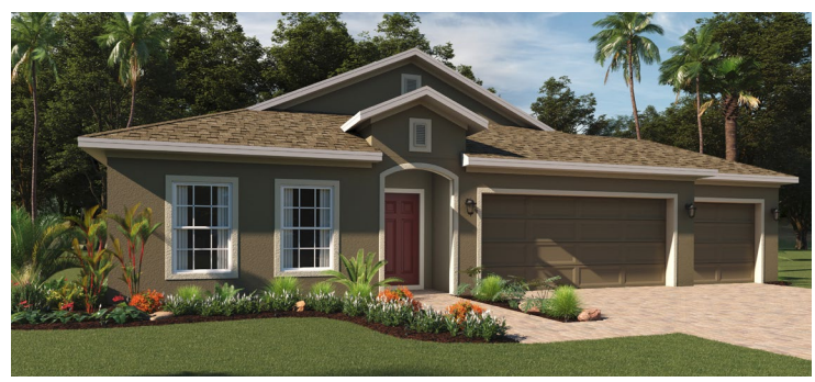
ELEVATION 2 - STUCCO