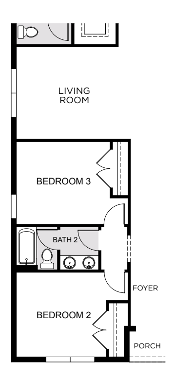
OPTIONAL LIVING ROOM AND BEDROOM 2