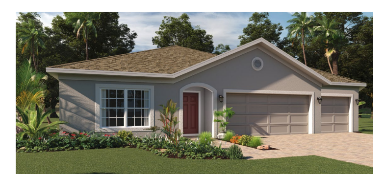
ELEVATION 1 - STUCCO