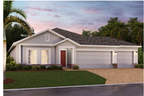
ELEVATION 3 - STONE