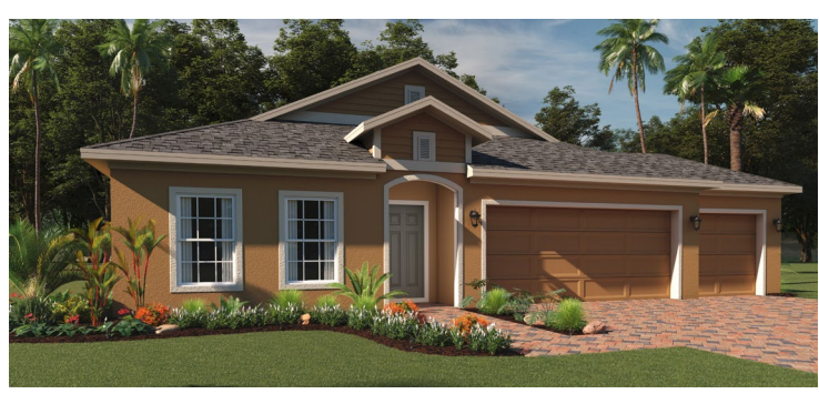
ELEVATION 2 - CLADDING