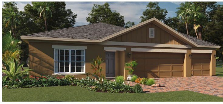
ELEVATION 1 - CLADDING