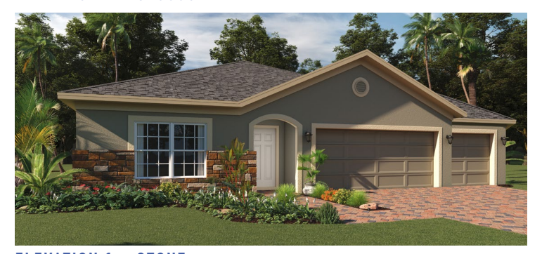
ELEVATION 1 — STONE