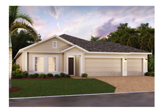
ELEVATION 3 - CLADDING