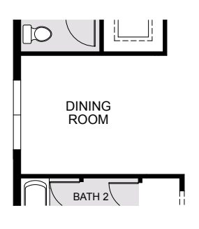
OPTIONAL DINING ROOM