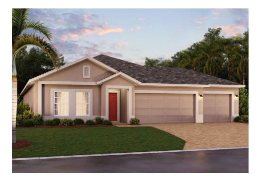
ELEVATION 3 - STUCCO