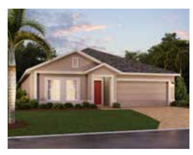
ELEVATION 3 - STUCCO