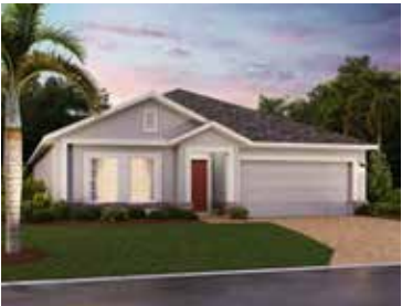
ELEVATION 3 - STONE