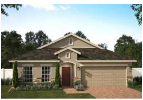
ELEVATION 2 - STONE