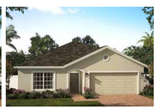
ELEVATION 1 - STUCCO