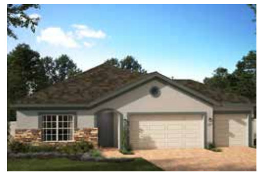
ELEVATION 1 - STONE WITH 3-CAR GARAGE OPTION

2,103 Square Feet · 4 Bedrooms · 2 Baths · 2-Car Garage