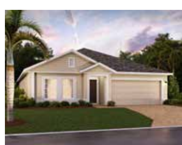
ELEVATION 3 - HARDIE

Renderings shown are examples - see sales office for range of finishes and configurations for the homes in this community.