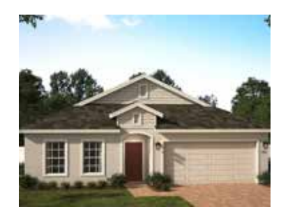
ELEVATION 2 - HARDIE