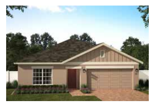
ELEVATION 1 - HARDIE