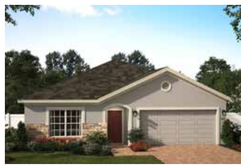
ELEVATION 1 - STONE