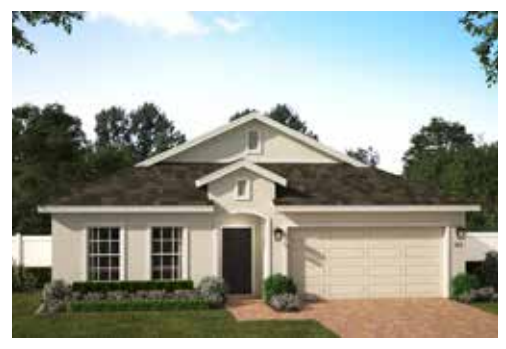
ELEVATION 2 - STUCCO