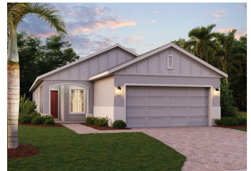
ELEVATION 3 - CLADDING