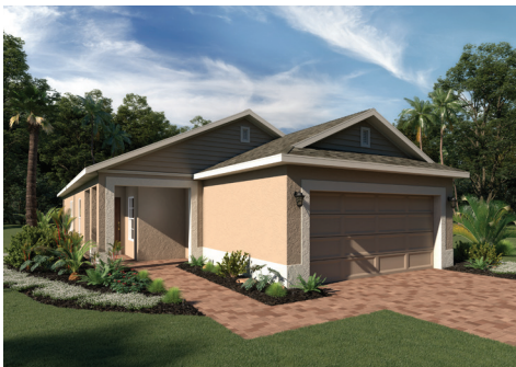
ELEVATION 2 - CLADDING