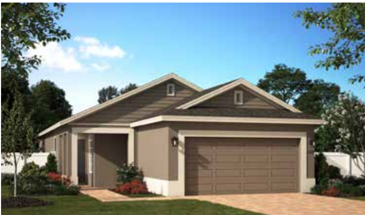
ELEVATION 2 - HARDIE