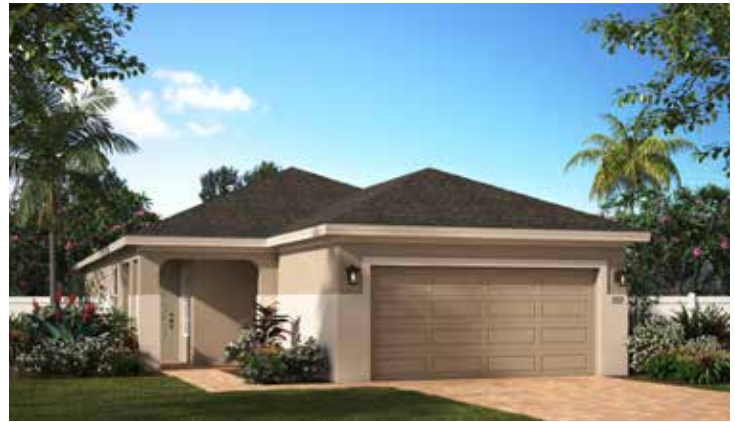
ELEVATION 1 - STUCCO