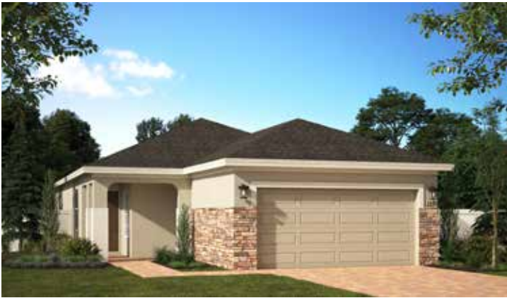
ELEVATION 1 - STONE