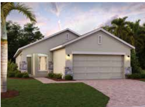
ELEVATION 3 - STONE