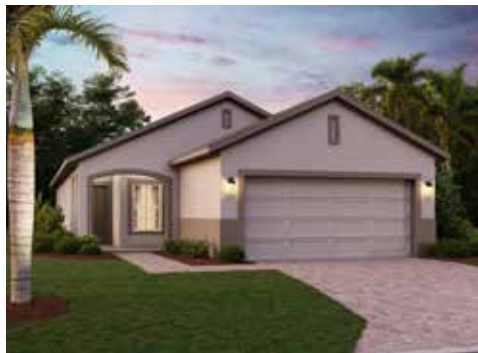
ELEVATION 3 - STUCCO