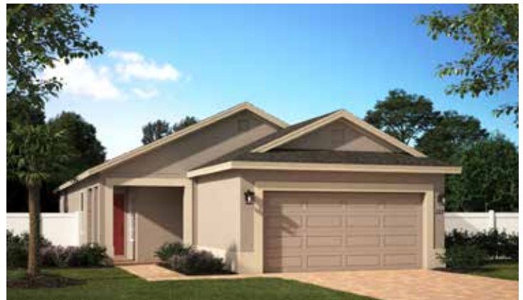
ELEVATION 2 - STUCCO