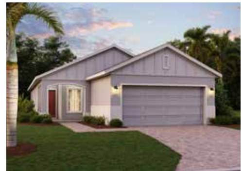
ELEVATION 3 - HARDIE

Renderings shown examples - see sales office for range of finishes and configurations for the homes in this community.