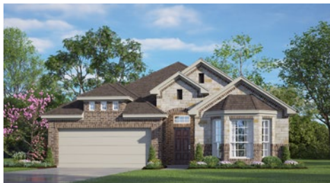
ELEVATION B - STONE