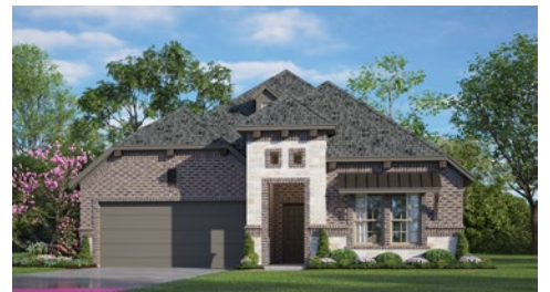
ELEVATION C - STONE

12529 Yellowstone Street, Godley, TX 76044 • (817) 438-2772