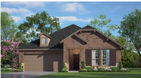
ELEVATION A - STONE