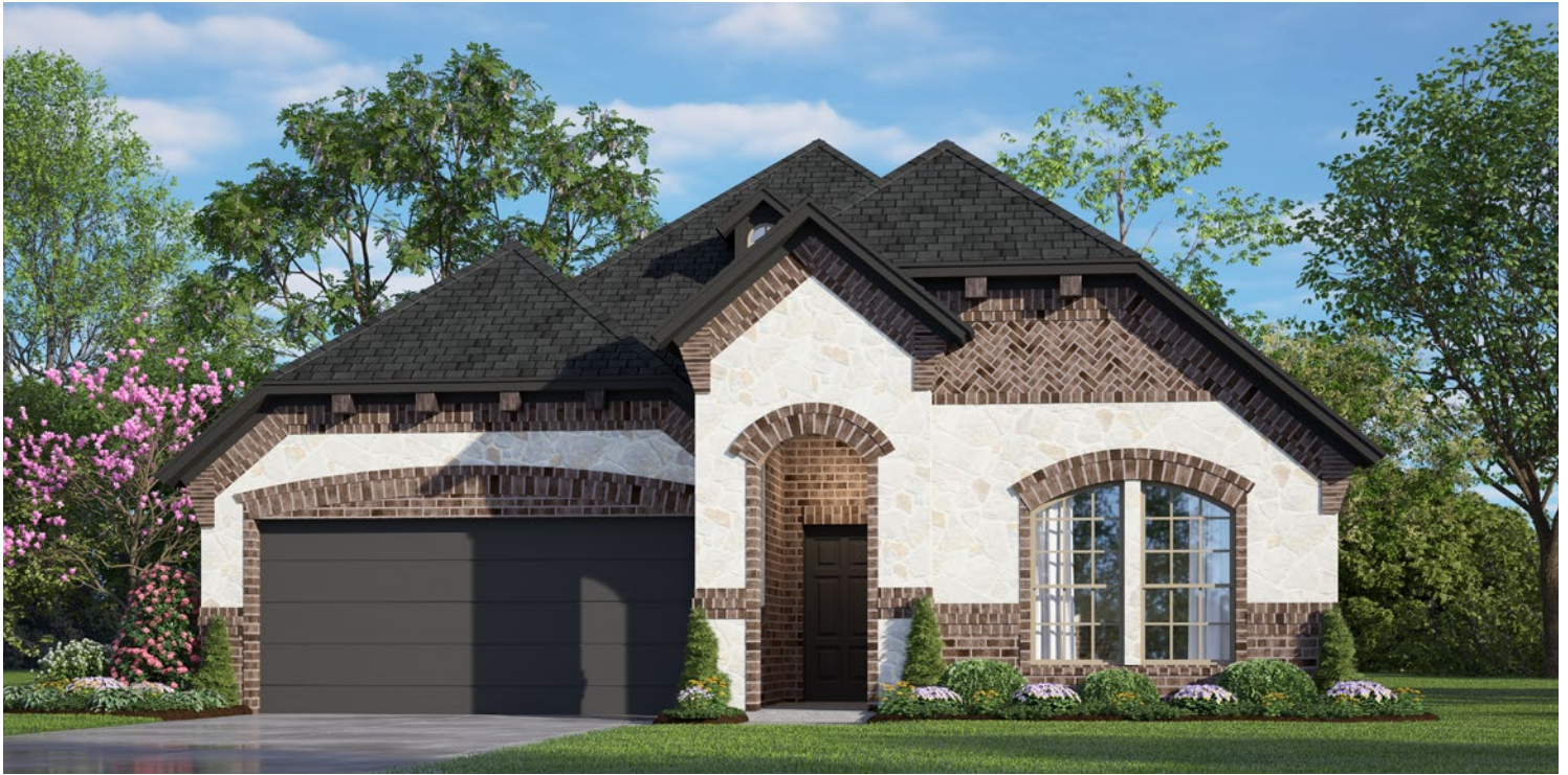
ELEVATION D - STONE

1,841 Square Feet • 3 Bedrooms • 2 Baths • 2-Car Garage