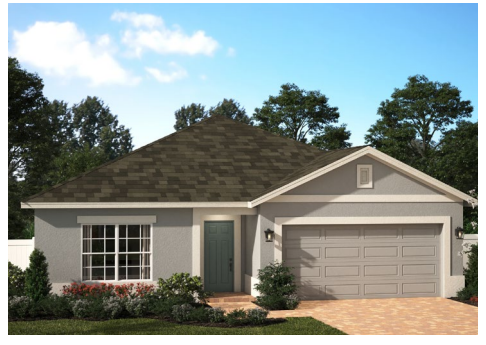
ELEVATION 2 - STUCCO