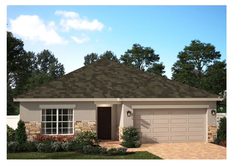
ELEVATION 1 - STONE