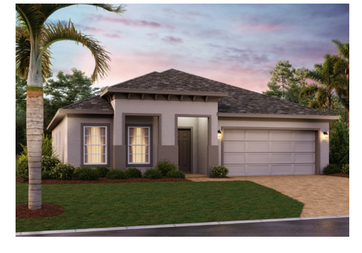
ELEVATION 3 - STUCCO