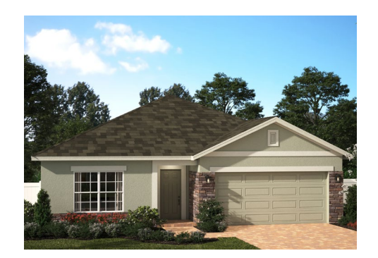
ELEVATION 2 - STONE