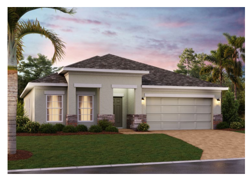
ELEVATION 3 - STONE