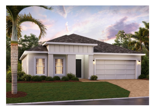
ELEVATION 3 - HARDIE

Renderings shown are examples - see sales office for range of finishes and configurations for the homes in this community.