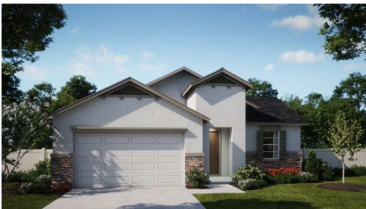
FRENCH COUNTRY ELEVATION

2442 PINWHERRY ST., PALM BAY, FL 32907 • (321) 218-4144