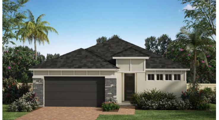
WEST INDIES ELEVATION