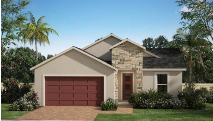
MODERN EUROPEAN ELEVATION

Approx. 2,125 Sq. Ft. • 3 – 4 Bedrooms + Study + Office 2 – 3 Bathrooms • 2-Car Garage