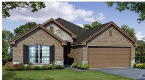
ELEVATION B - STONE

10345 Dittany Lane, Fort Worth, TX 76036 • (817) 704-4120