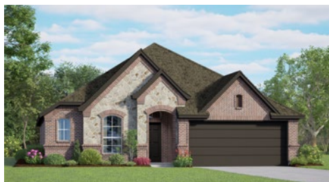
ELEVATION D - STONE

10345 Dittany Lane, Fort Worth, TX 76036 • (817) 704-4120