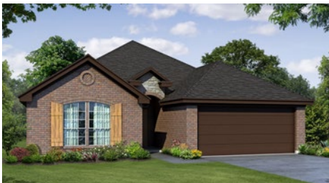
ELEVATION A - STONE