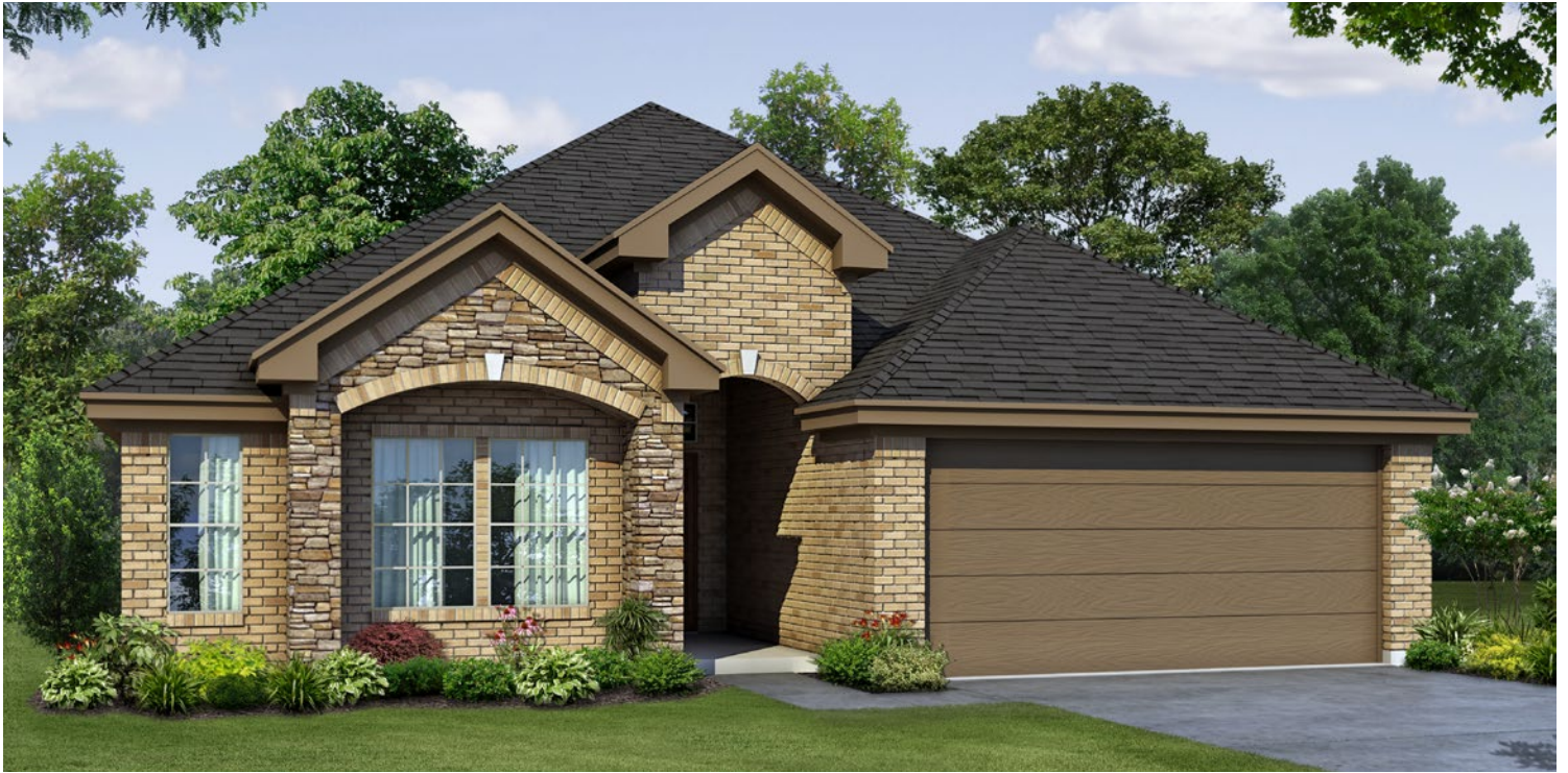
ELEVATION C - STONE

1,730 Square Feet • 3 Bedrooms • 2 Baths • 2-Car Garage