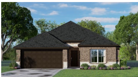
ELEVATION A - STONE