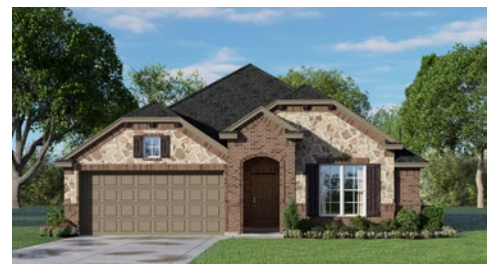
ELEVATION C - STONE

10345 Dittany Lane, Fort Worth, TX 76036 • (817) 704-4120