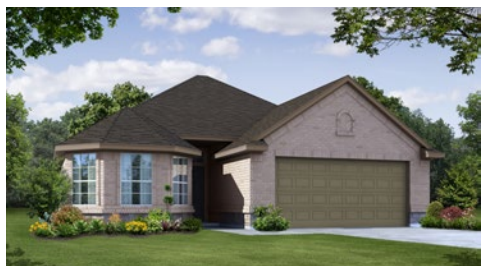
ELEVATION A - STONE