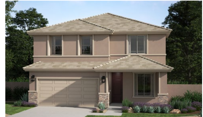
DESERT PRAIRIE ELEVATION