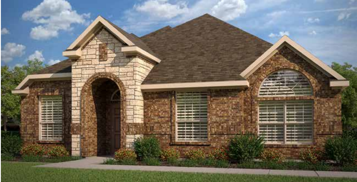
ELEVATION A – STONE

352 Pasture Drive, Midlothian, TX 76065 • (469) 609-1652