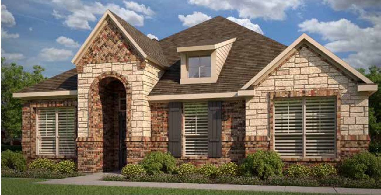
ELEVATION B – STONE

2,086 Square Feet • 4 Bedrooms • 2 Baths • 2-Car Garage