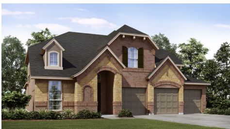
ELEVATION B - STONE

113 Aria Court, Forney, TX 75126 • (817) 736-1289