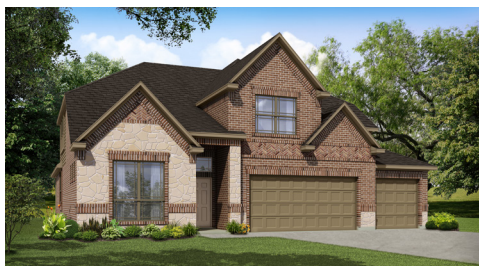
ELEVATION A - STONE