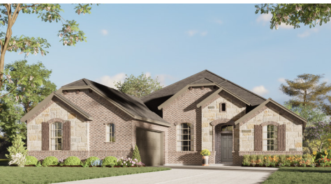
ELEVATION A - STONE