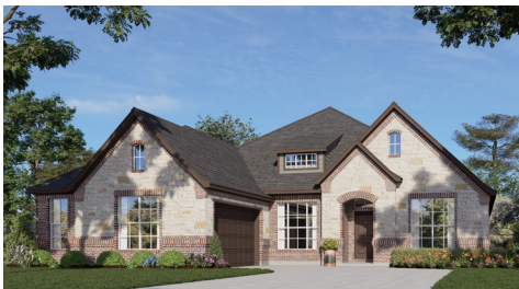
ELEVATION B - STONE

113 Aria Court, Forney, TX 75126 • (817) 736-1289