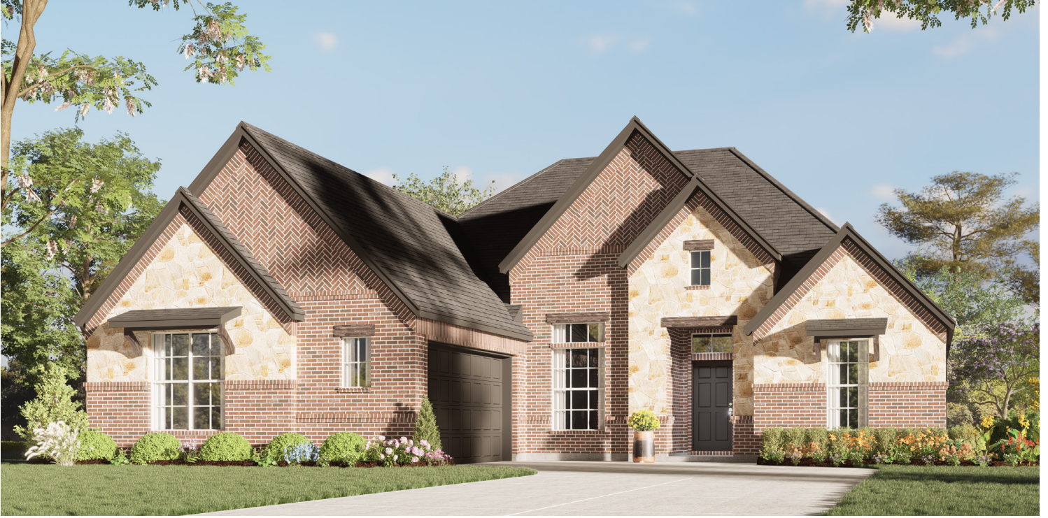
ELEVATION C - STONE

2,370 Square Feet • 4 Bedrooms • 2 Baths • 2-Car Garage