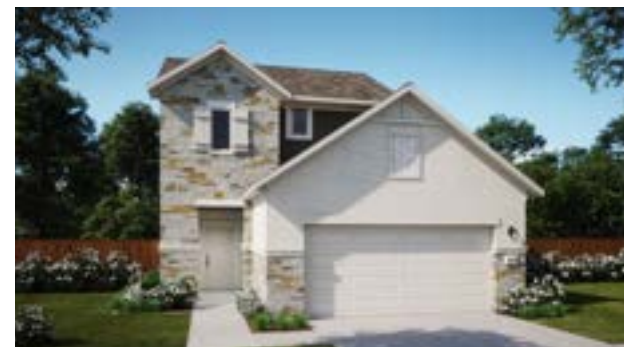
ELEVATION B - STONE