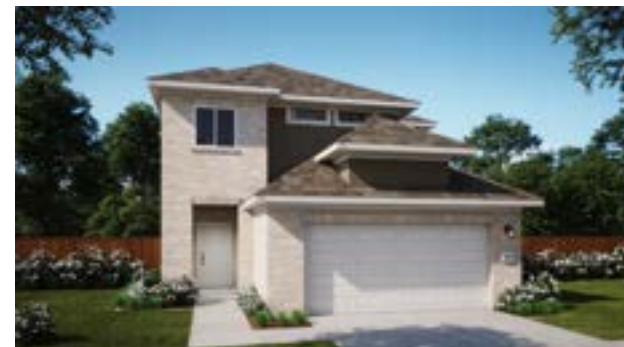
ELEVATION A - STUCCO