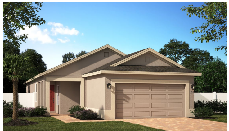
ELEVATION 2 - STUCCO