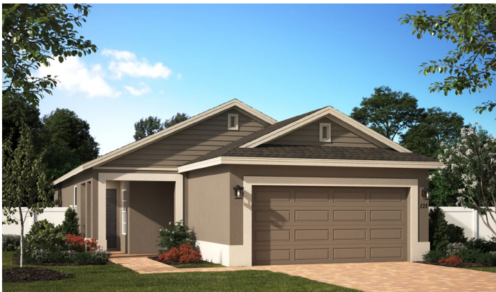
ELEVATION 2 - HARDIE