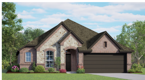
ELEVATION D - STONE

4721 Sassafas Drive, Fort Worth, TX 76036 • (817) 704-4120