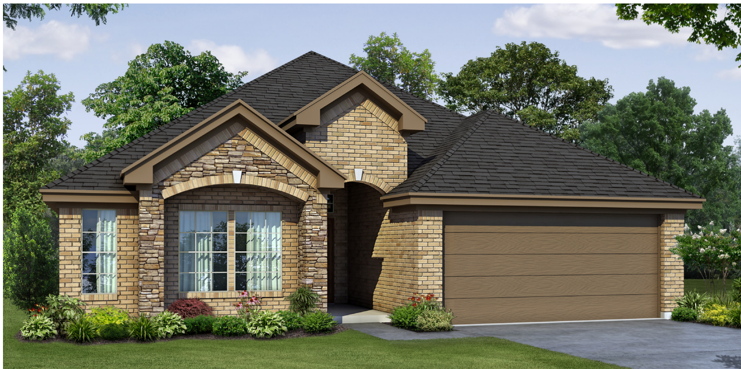
ELEVATION C - STONE

1,730 Square Feet • 3 Bedrooms • 2 Baths • 2-Car Garage