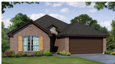
ELEVATION A - STONE