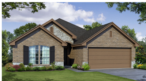
ELEVATION B - STONE

4721 SassafRAS Drive, Fort Worth, TX 76036 • (817) 704-4120