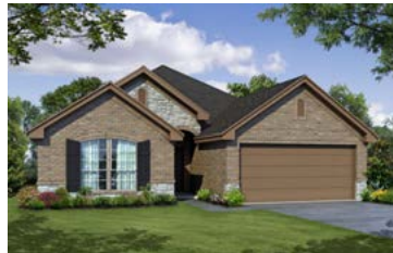
ELEVATION B – STONE