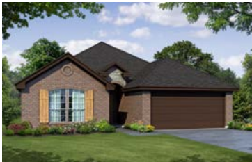
ELEVATION A – STONE