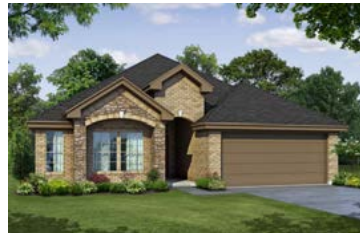
ELEVATION C – STONE

4413 Sweet Acres Avenue, Joshua, TX 76058 • (817) 670-5958