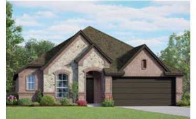
ELEVATION D – STONE