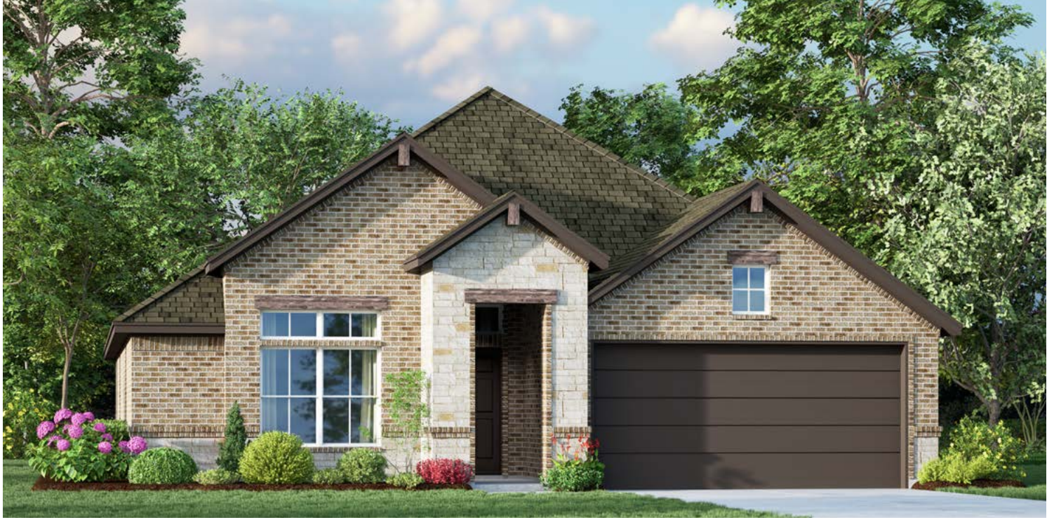
ELEVATION E – STONE

1,730 Square Feet • 3 Bedrooms • 2 Baths • 2-Car Garage