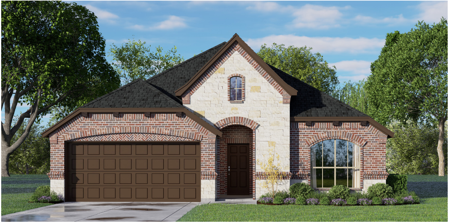
ELEVATION D - STONE

1,660 Square Feet • 3 Bedrooms • 2 Baths • 2-Car Garage