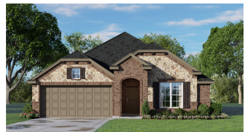
ELEVATION C - STONE

4721 Sassafas Drive, Fort Worth, TX 76036 • (817) 704-4120