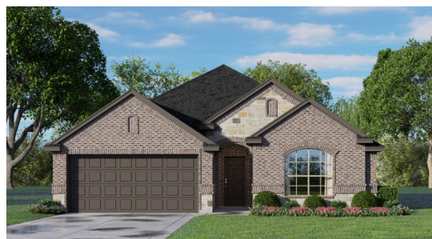
ELEVATION B - STONE