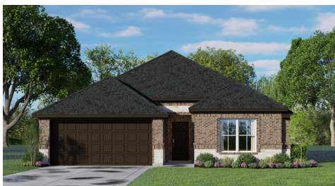
ELEVATION A - STONE