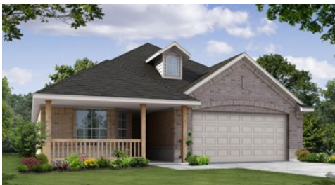
ELEVATION B - STONE

902 Misty Lane, Cleburne, TX 76033 • (817) 854-2229