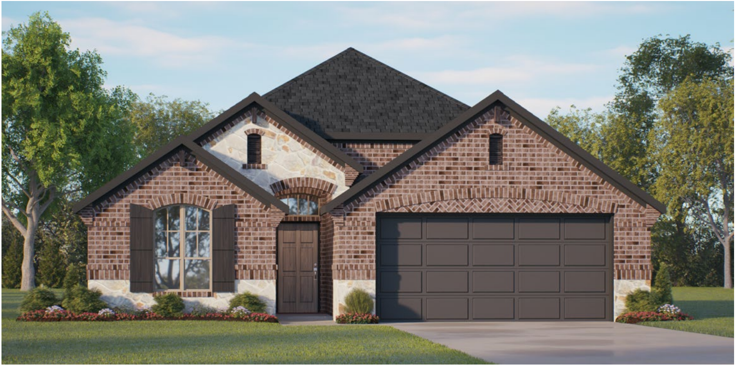
ELEVATION C - STONE

1,503 Square Feet • 3 Bedrooms • 2 Baths • 2-Car Garage