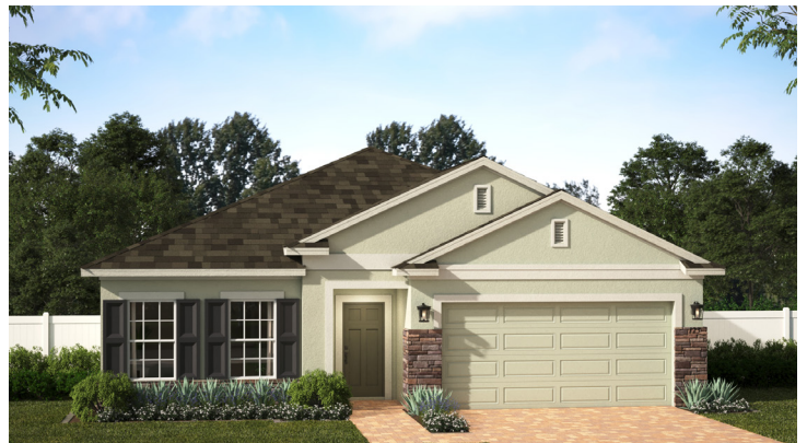
ELEVATION 2 - STONE