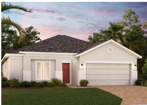
ELEVATION 3 - STUCCO