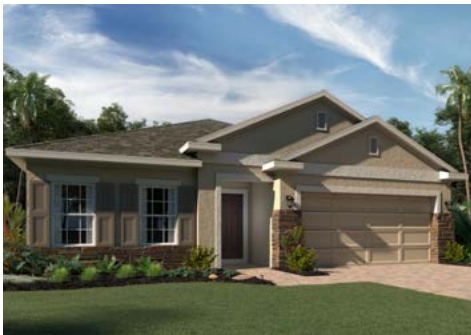
ELEVATION 2 - STONE