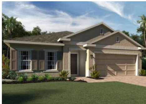
ELEVATION 2 - STUCCO