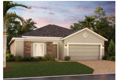
ELEVATION 3 - STONE