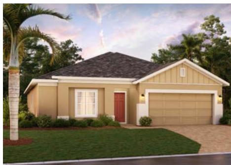
ELEVATION 3 - HARDIE

Renditions shown examples - see sales office for range of finishes and configurations for the homes in this community.