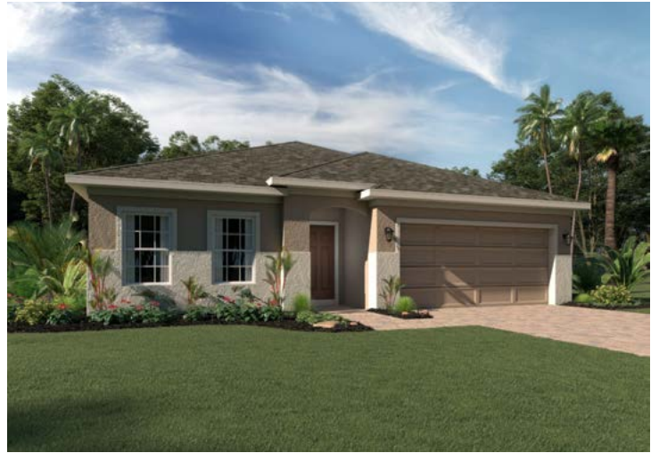
ELEVATION 1 - STUCCO