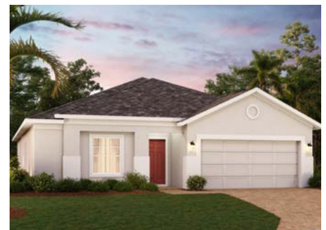
ELEVATION 3 - STUCCO

591 Darshire Avenue, Eustis, FL 32736 • (407) 392-2601