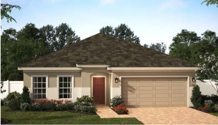
ELEVATION 1 - STUCCO

1,819 Square Feet • 4 Bedrooms • 2 Baths • 2-Car Garage