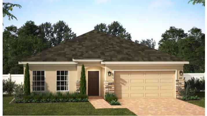
ELEVATION 1 - STONE