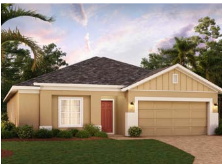
ELEVATION 3 - HARDIE