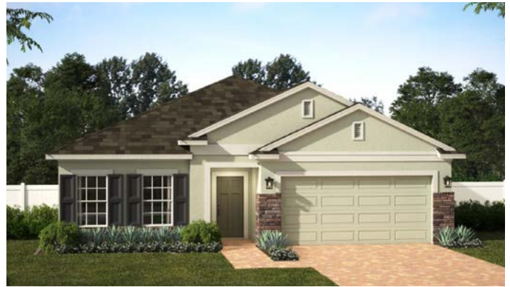
ELEVATION 2 - STONE