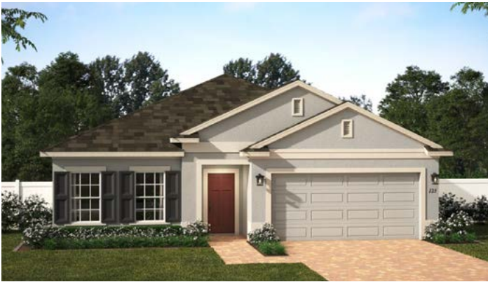
ELEVATION 2 - STUCCO