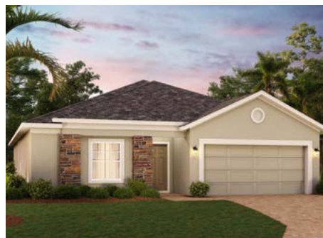
ELEVATION 3 - STONE