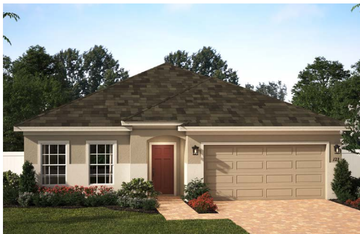
ELEVATION 1 - STUCCO

1,819 Square Feet • 4 Bedrooms • 2 Baths • 2-Car Garage