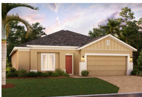
ELEVATION 3 - HARDIE

512 Meadow Bend Drive, Davenport, FL 33837 • (407) 550-5889