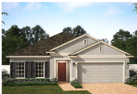
ELEVATION 2 - STUCCO