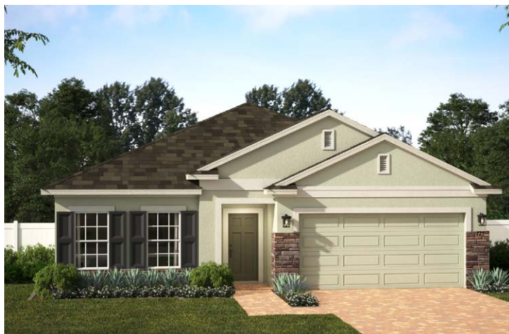
ELEVATION 2 - STONE