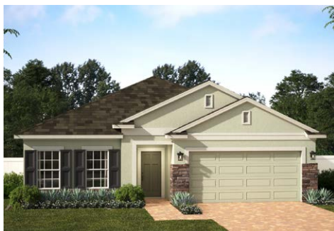
ELEVATION 2 - STONE