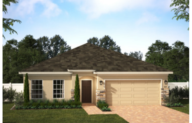
ELEVATION 1 - STONE