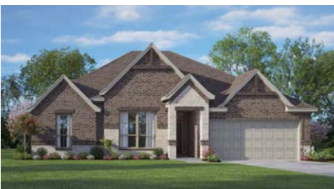
ELEVATION B - STONE