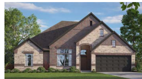
ELEVATION C - STONE

902 Meadow View Drive, Cleburne TX 76033 • (817) 704-4086