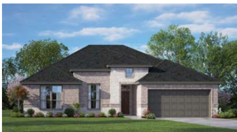
ELEVATION A - STONE