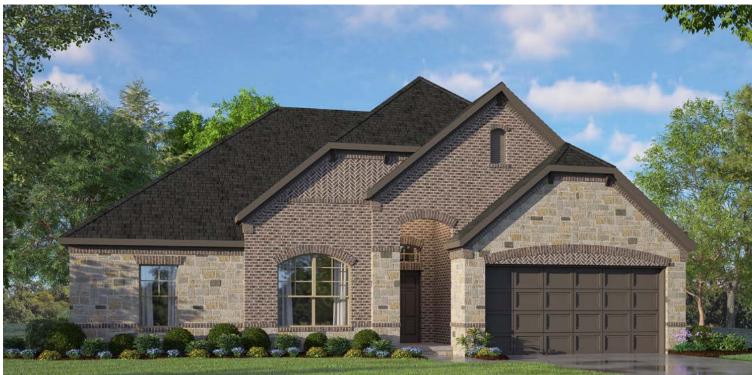
ELEVATION D - STONE

2,069 Square Feet • 3 Bedrooms • 2 Baths • 2-Car Garage