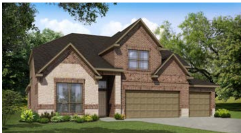
ELEVATION A – STONE