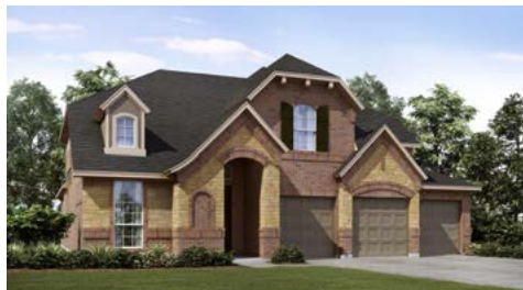
ELEVATION B – STONE

4413 Sweet Acres Avenue, Joshua, TX 76058 • (817) 670-5958