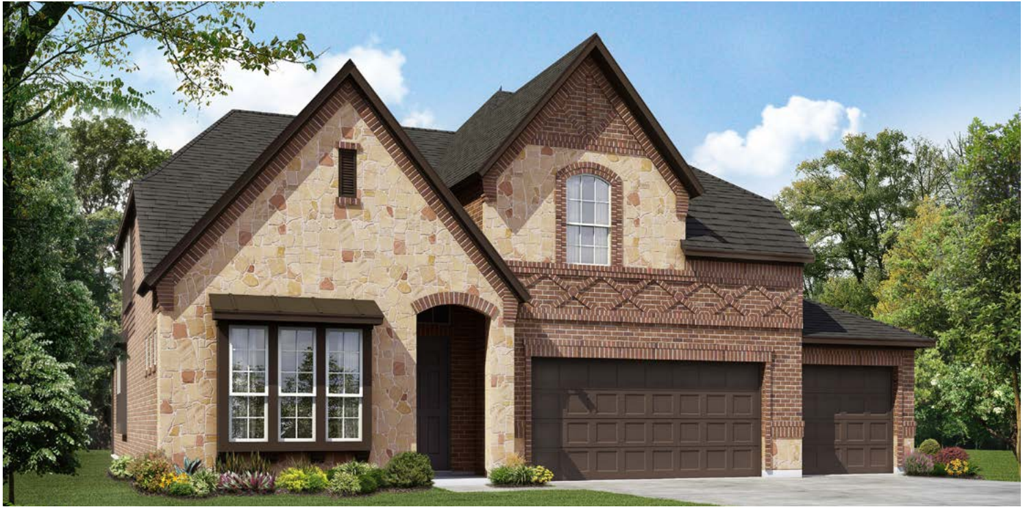
ELEVATION C – STONE

3,015 Square Feet • 4 Bedrooms • 3.5 Baths • 3-Car Garage