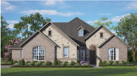
ELEVATION B - STONE

709 Winecup Way, Midlothian, TX 76065 • (817) 752-4525