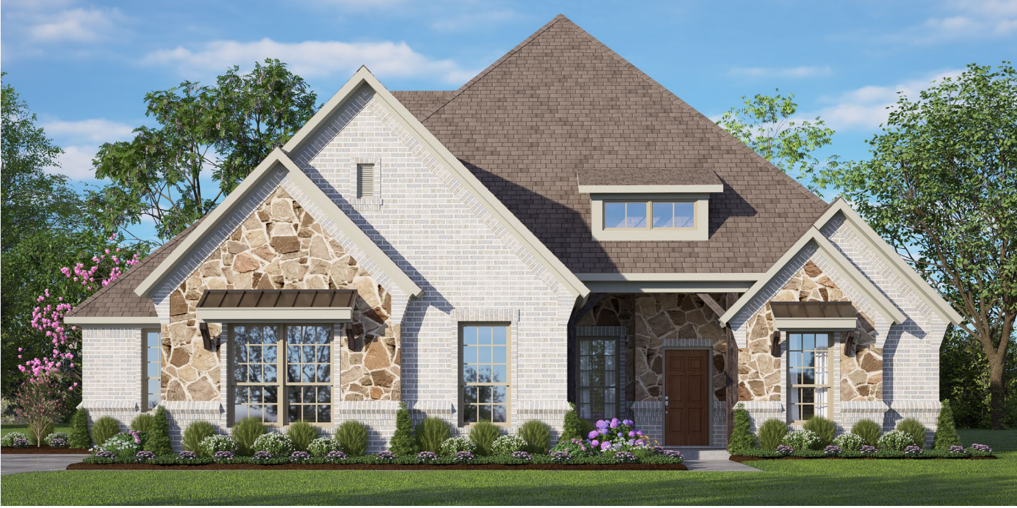
ELEVATION C - STONE

2,555 Square Feet • 3 Bedrooms • 2.5 Baths • 2-Car Garage