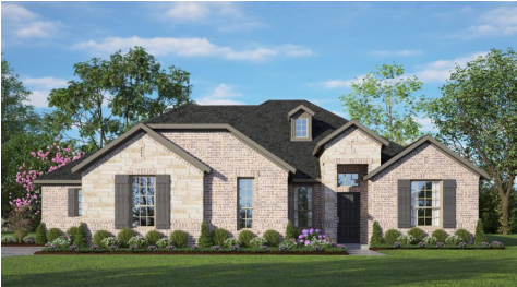
ELEVATION A - STONE