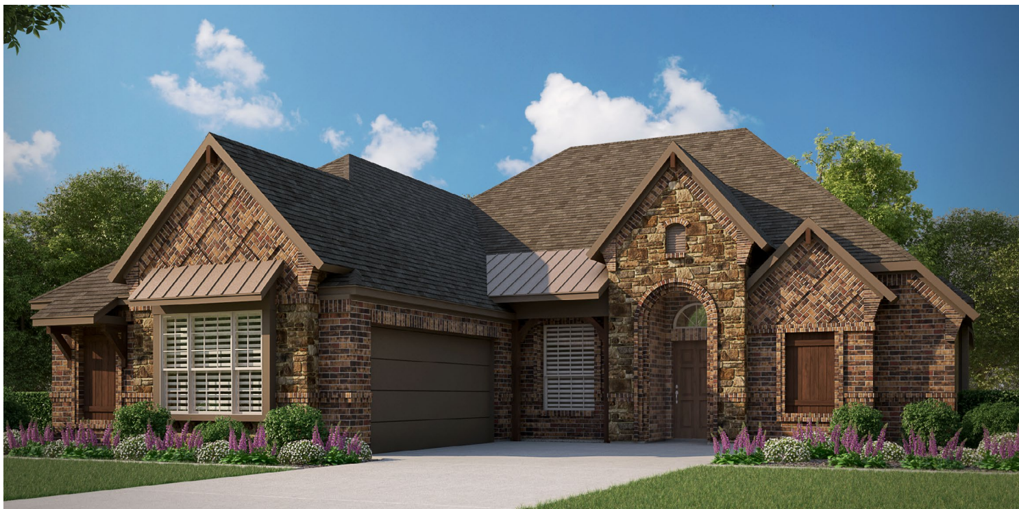
ELEVATION D - STONE

2,404 Square Feet • 3 Bedrooms • 2 Baths • 2-Car Garage